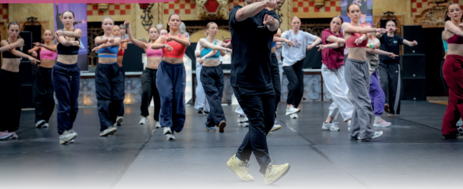
Street with Elliot Plate